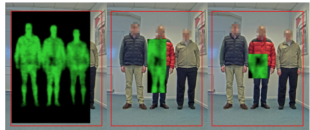
Images from Thruvision TAC unit showing variable screening camera preset fields of view. Users can also select custom field of view (not shown) anywhere within the red box (called the field of regard)

Designed to screen moving people, the TAC is completely safe and non-intrusive, and uses Thruvision's patented terahertz technology.