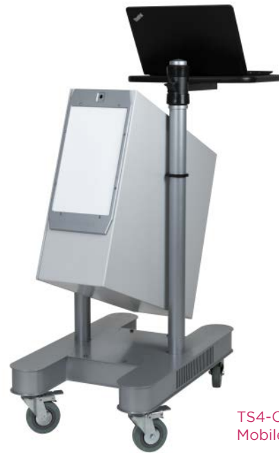
TS4-C mounted on Mobile Operator Station