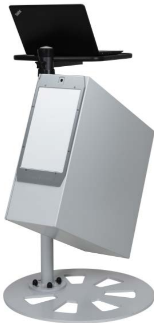
TS4-C on fixed stand