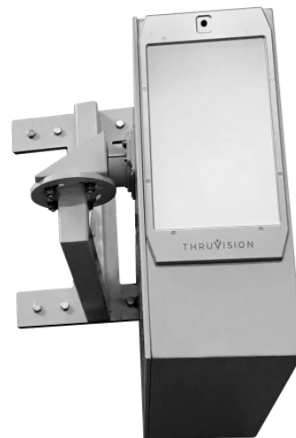
TS4-C mounted on Wall Bracket