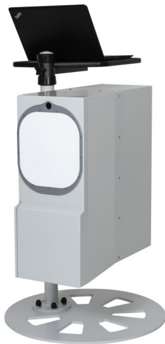
LPC on fixed stand

Reliably detects items as small as 3cm x 3cm