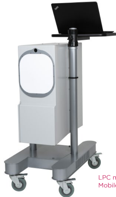
LPC mounted on Mobile Operator Station