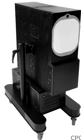
CPC16 on mobile stand

Detects all types of metallic and non-metallic material