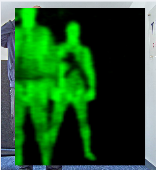
Use large field-of-view for situational awareness

Variable, user-selectable field-of-view for increased operational flexibility and detection performance