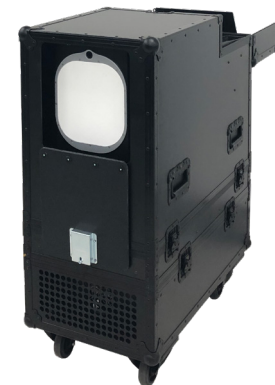
TAC8 in Tactical Deployment System (TDS)