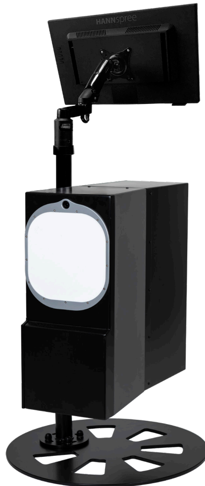
TAC8 on Fixed Stand

High-performance people-screening camera to detect items on semi-stationary people