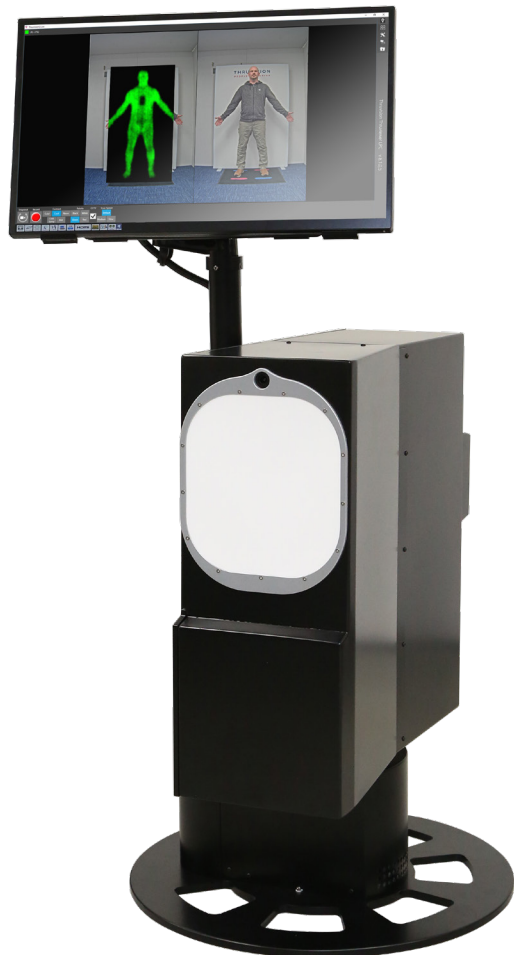
LPC8 on Fixed Stand with touchscreen display

High performance camera designed to detect different sized items on stationary employees at a safe screening distance of 3 m