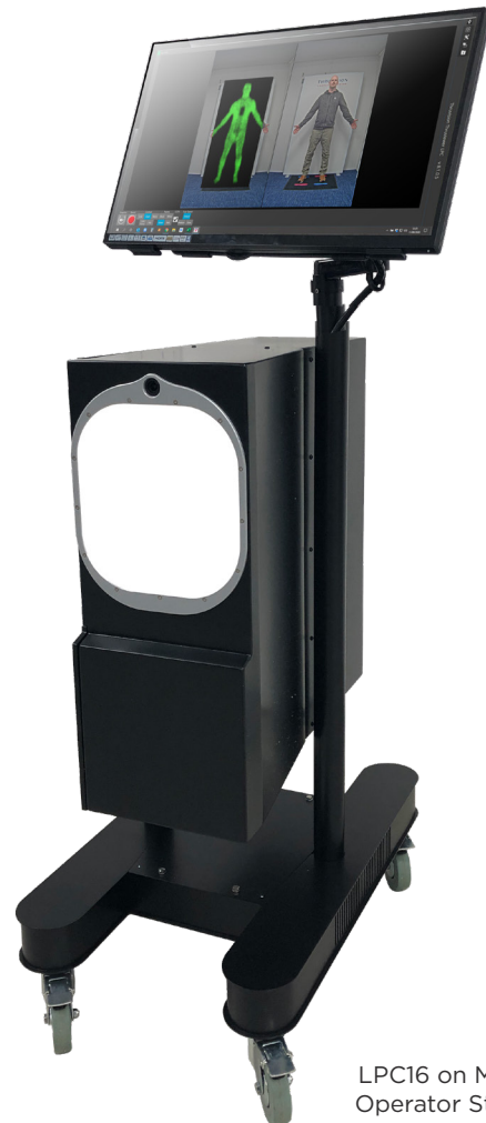
LPC16 on Mobile Operator Station

Very high performance camera designed to detect different sized items on stationary employees at a safe screening distance of 3 m