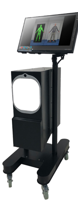
LPC on Mobile Operator Station