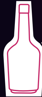
Image shows a 35 cl (12 fl oz) bottle of alcohol detected on a walking person at 3.5 m distance.