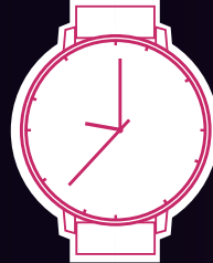
Image shows 50 x 50 mm metal watch detected on stationary person at 3.5 m distance.